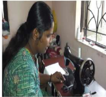
SHGs making Cloth Mask