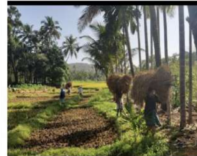
Harvesting of Paddy