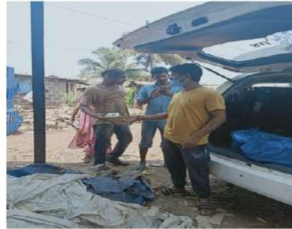
Cooked food Supplied by ULB's