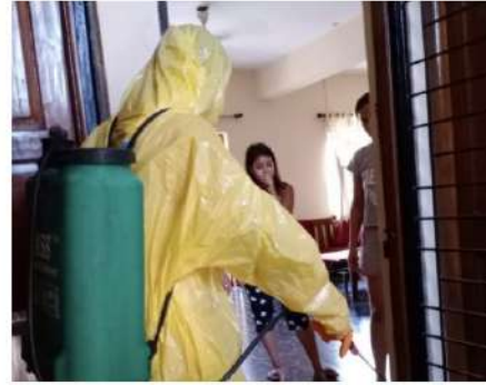
Waste Collection from Quarantine Houses