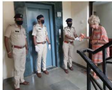
Helping our Guests