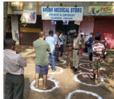
Facilitation of Essential Services