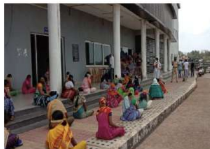
Medical Counselling At Shelters