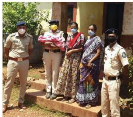
Proactive Outreach to Vulnerable Sections