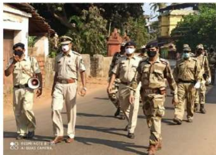
Enforcing the Lockdown