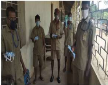
Daily Fresh mask to workers