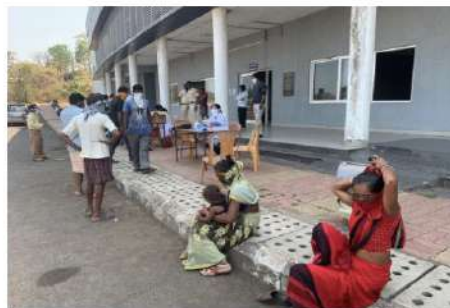
Health Camp At Shelters