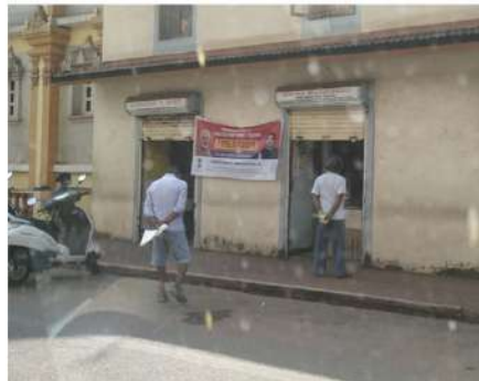
Free Ration at FPS under PMGKY