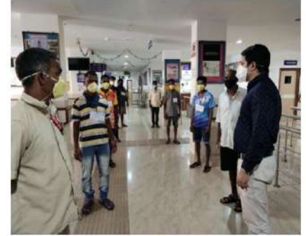
Awareness on Safety Measures