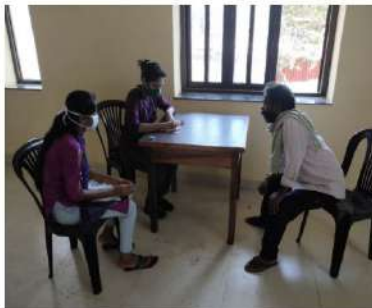
Medical Check-ups at Shelters