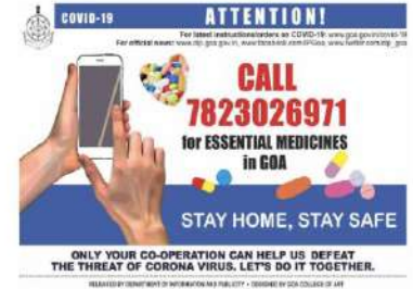
Medicines at Home