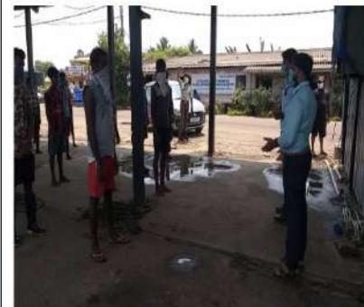
Awareness for Fishermen at Jetty