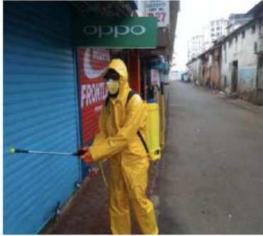
Sanitising Public Spaces