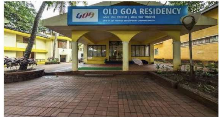
Old Goa Residency