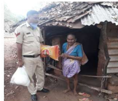
Delivering Essential Services