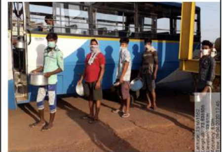
Geo-Tagged Ration Distribution