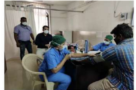
Health Check-up of Sanitation staff