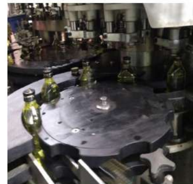
Alcohol Turned into Sanitizer

All registered construction workers (about 15,000), were sanctioned a monetary package equivalent to 15 days of wages of a semi-skilled worker. The Government sanctioned Rs 4,000 as a one time relief to all the existing beneficiaries availing GLWB (Goa Labour Welfare Board) schemes (about 3000)