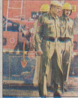
गुड़गांव-महरीली रोड स्थित डीटी सेंटर में शुक्रवार को आपदा प्रबंधन के अभ्यास के दौरान फायर टेंडर के नीचे कुचला गया आईटीबीपी का जवान (लाल घेरे में)।

धुएँ के कारण चालक यह नहीं देख सका कि कौन कहाँ है। जवान करीब पीने बारह